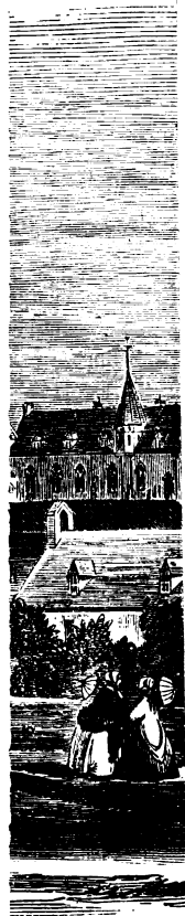
, Isle of Cumk